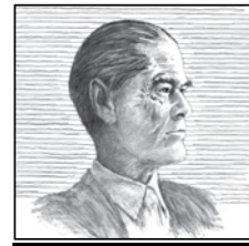
IAN CLUNIES ROSS MEMORIAL FOUNDATION