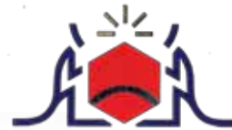
THE INSTITUTION OF ENGINEERS, AUSTRALIA